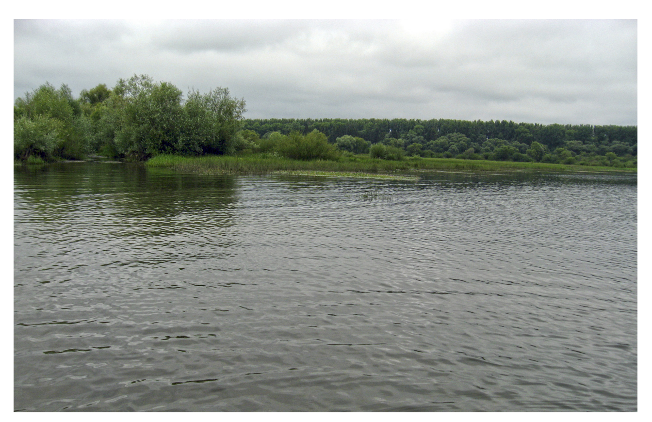
Fig. 2. Northern shore with the littoral zone overgrown by macrophytes and with extensive wetlands (site No. 8).