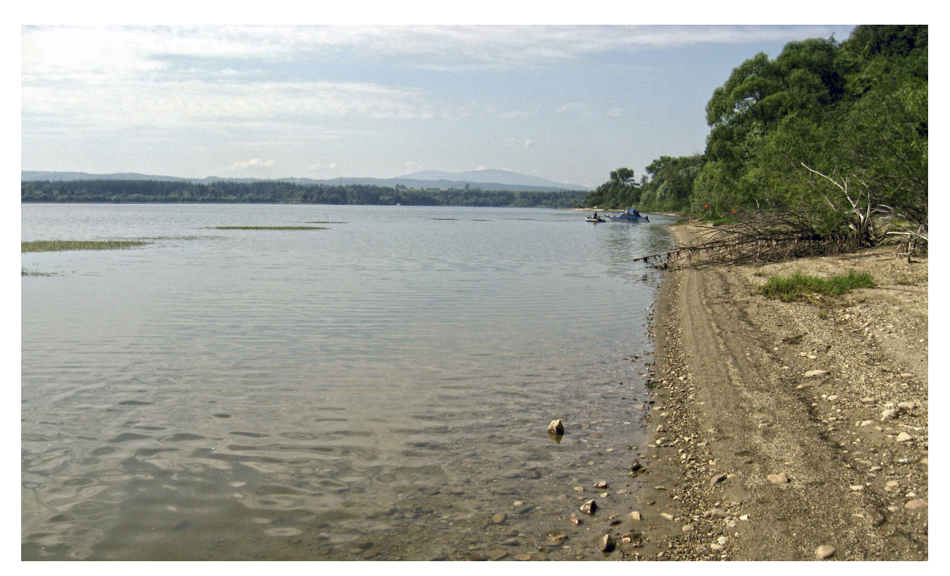
Fig. 3. Shore of the Orava dam reservoir nearly bare of vegetation (site No. 10).

The native Aplexa hypnorum, Anodonta cygnea and the non-native Potamopyrgus antipodarum and Physa acuta were found in this area for the first time and their sites are outside the known range in Slovakia (HORSÁK et al. 2020).